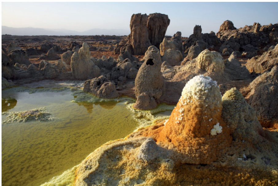
Geoscientists are needed in areas such as Ethiopia's Danakil Depression to study tectonic plates.